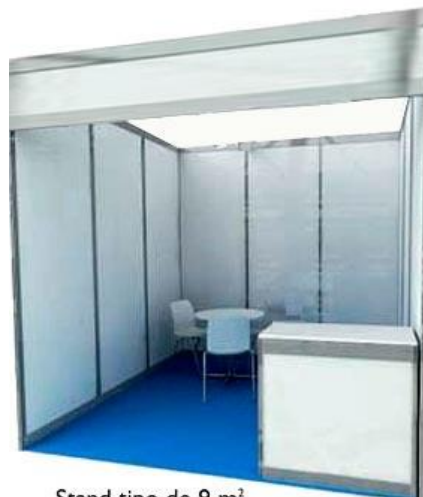
Stand tipo de 9 m 2